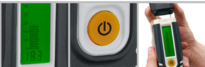
Large, clear LCD