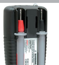
Test prod holder