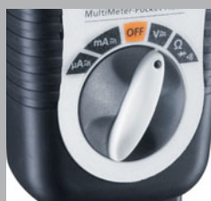
Easy-to-use rotary function knob