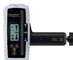
SensoLite 410 Set including universal mount + battery