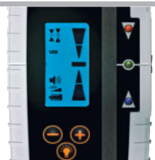
Illuminated LC display, super-bright signal LEDs