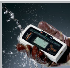
Water and dust protection per IP 67

with battery / without universal mount 0,29 kg