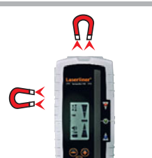
Strong head and side magnets