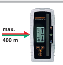
For red and green laser